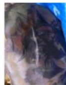
Male Tattoo 3.jpg