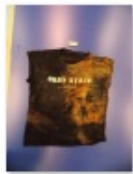
Black t-shirt Front.jpg