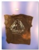
Black t-shirt Back.jpg