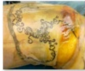
Female Tattoo 1.jpg