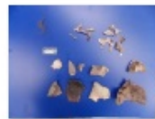
Skull frags near ME-15-0366.jpg