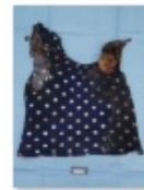
Female #2 Shirt.jpg