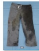
Female #2 pants.jpg